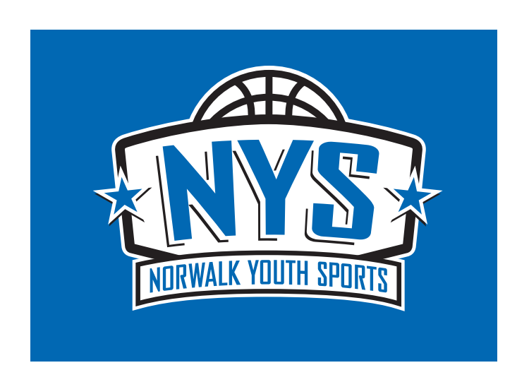
Artwork for royal blue uniform