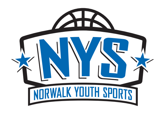
Artwork for white uniform

Do not modify the line art. Keep the artwork size as close as possible to the provided artwork in this guide.